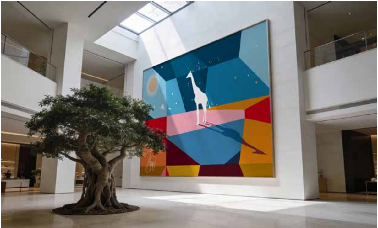
Whales' Singing, 2026 Acrylic Glass and aluminium 75 x 50 cm. Edition of 6

Conceived as physical wall works, these pieces explore how geometry can remain dynamic and responsive, engaging with space while maintaining a strong visual autonomy.