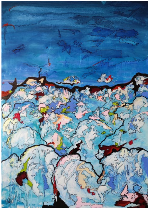
NEVERLAND Acrylic on canvas 100 x 140 cm 2023, The Netherlands