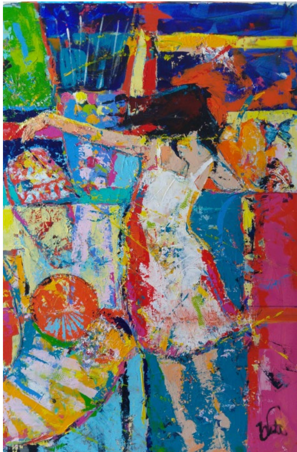
Random Dancer Acrylic on canvas 100 x 150 cm 2018, The Netherlands